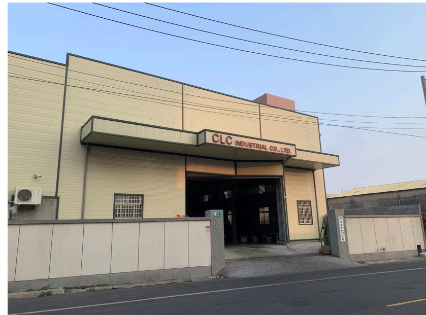
2021 - 3 rd factory