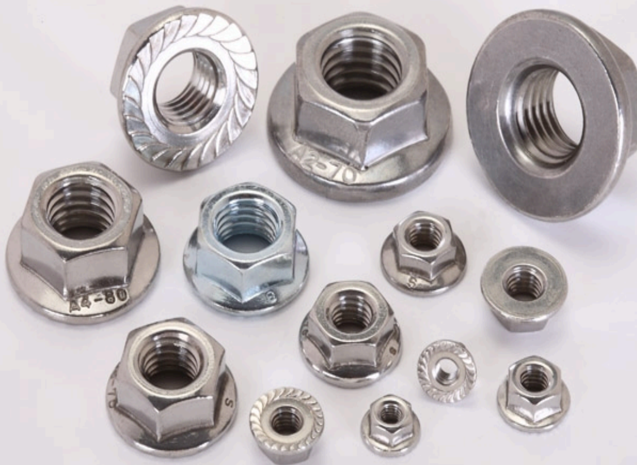
HEX FLANGE NUTS