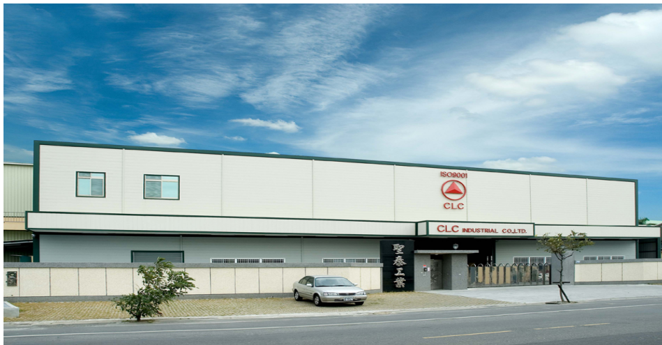
2009 - 2 nd factory