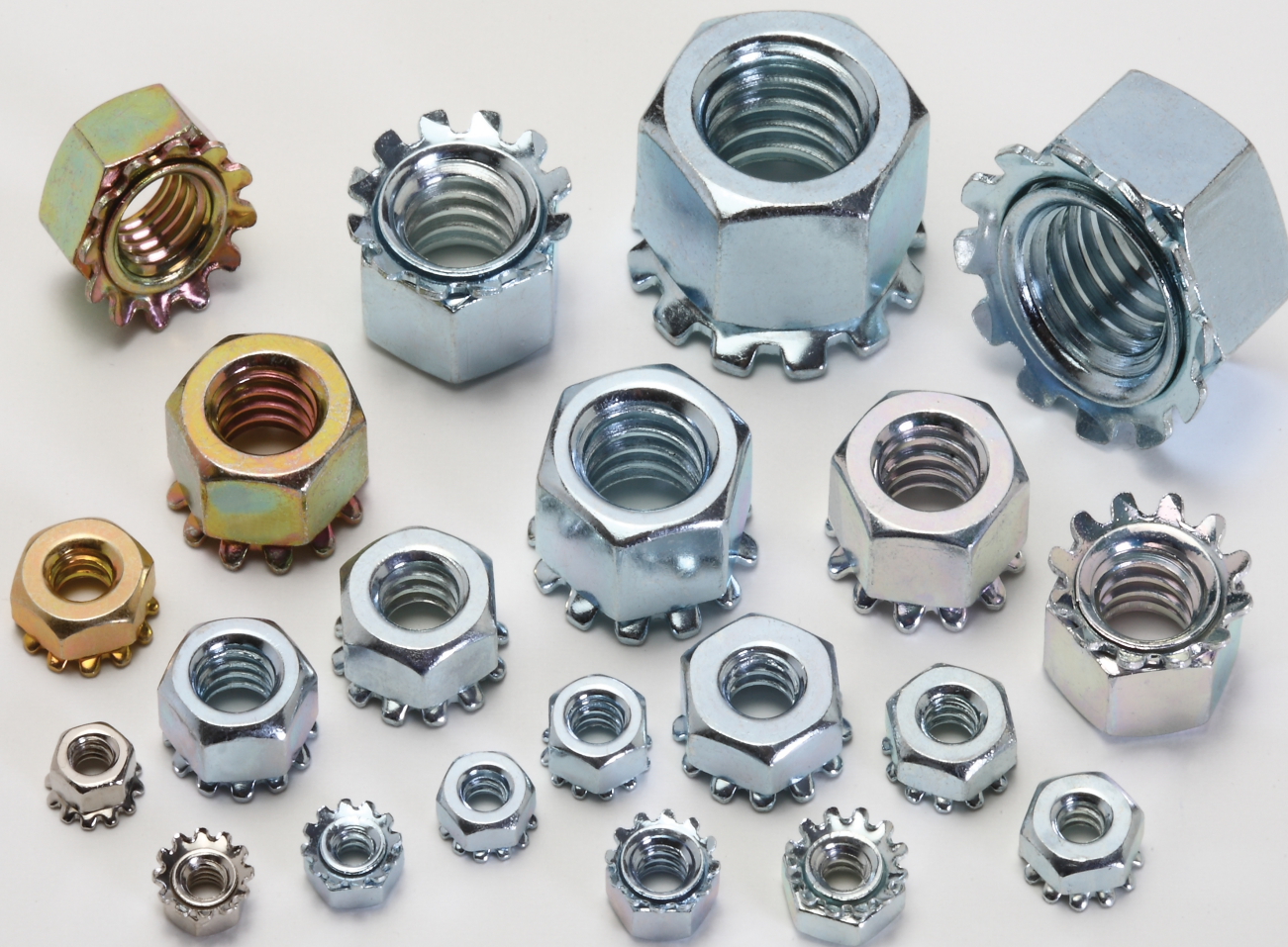
HEX K-LOCK NUTS