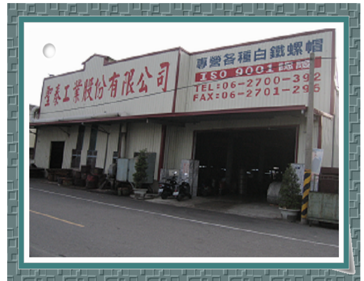
2003 - 1 st factory